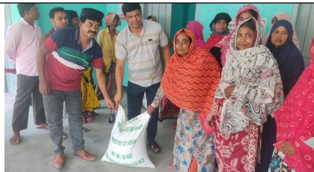
VGD Rice distribution for VGD members at Kathuli union of Gangni Upazilla