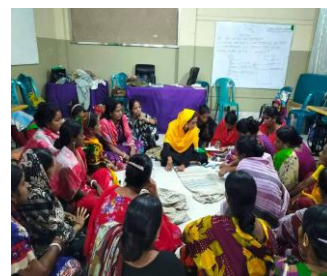
*Fashion, Tailoring and Embroidery Training for Independent & Empowerment.

CDP arranged training on Fashion, Tailoring and Embroidery for divorced, Dalit, Horizon, trafficked survivors, women labour, sex-workers and disadvantaged women at CDP working areas and at CDP training centre. CDP also organized workshops and training market linkages and market accessibility with women organizations. During this year, 2587 vulnerable women, divorced, women day labour and disadvantaged women received training. After getting Fashion, Tailoring and Embroidery training women are earning from their home and maintain their families and spending money for the children education program. CDP is selling group member's handmade handicraft products to local, national and abroad market.