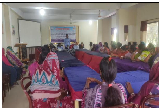
Training on Right to Food, Environmentally Agriculture, Introduce Science and Technology Innovation

CDP arranged two workshops on sustainable Smart Agriculture , climate resilient crops production activities with 100 women farmers including government Upazilla Nirbahi Officer, Meherpur Sador Upazilla and local NGOs officials and media group at Meherpur. CDP received fund from the Ministry of Science and Technology. Under the Smart Agriculture Project CDP covered Right to Food, Environmentally Agriculture, Introduce Science and Technology Innovation with the rural and semi-urban people.