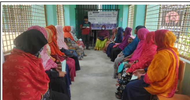
VGD Training on Income Generation and entrepreneurship development

Vulnerable Group Development Program (VGD), now its name Vulnerable Women Benefit Program (VWBP) is a food security, life skills development and Income generation program under the department of Women Affairs, Bangladesh for the Ultra poor and vulnerable women. CDP is implementing this program among 24 unions of 2 Upazilas (Alamdanga & Gangni) under 2 districts (Chuadanga & Meherpur) with the local government since March 2015. Every month CDP provided life oriented skills development training and entrepreneurship development & income generating training to 2587 vulnerable women under this project. 2587 vulnerable women get 30 kgs of good rice from union Parishad each month for their livelihoods.