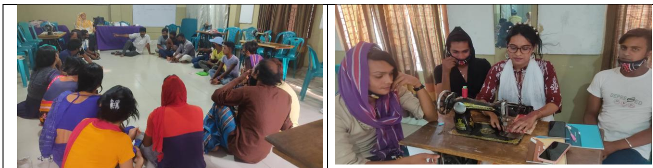
CDP organized training on Fashion Design & Sewing Training for Transgender

CDP organized Fashion Design & Sewing training for Transgender community by the support of Ministry of Social Service, Dhaka. The pictures are given below:-