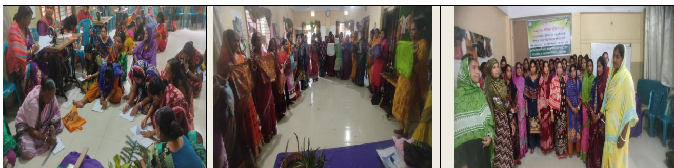
Fashion Design & Tailoring Training Organized by CDP at Meherpur

Fashion Design and tailoring training was organized by Centre for Development & Peace (CDP), Meherpur by the support of Jono Proshason Montronaloi, Dhaka. The pictures are given below of the training:-