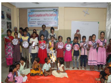
Children Annual Art competition

The Joyful Learning School for Underprivileged Children & Youth , implemented by the Centre for Development and Peace (CDP), promoted inclusive, play-based education for marginalized groups such as Dalit, Horizon, and Bede communities from January to December. The initiative began with a Project Inception Meeting, engaging stakeholders and showcasing children's talents through performances.