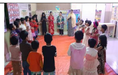
A Canadian citizen of Indian origin visited our children's school, observed their play-based learning session, and appreciated the children for confidently pursuing their vision."