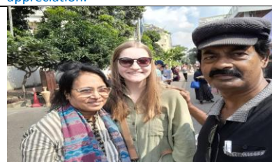
A buyer from France visited our CDP Craft Centre."