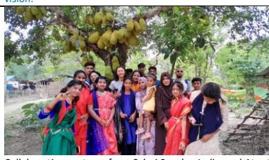
Collaboration partners from Sabuj Sangha, India, and Atoot, Nepal, visited CDP's programmes. They attended the marmalade workshop and visited the field to observe children and youth social action activities, including a drama on stopping child marriage. They highly appreciated our performance.