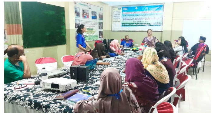
Tripty Boutique House Wins Feminist Green Action Award 2025