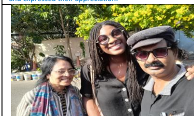
"An American buyer visited our CDP Craft Centre."