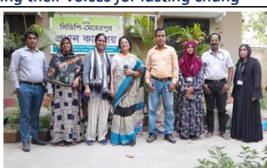
"The Oxfam Dhaka team visited our office to observe our work and expressed their appreciation."