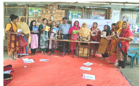
Sewing & Embroidery /income Gen Training

engages participants through adolescent clubs, providing training on essential life skills and critical awareness