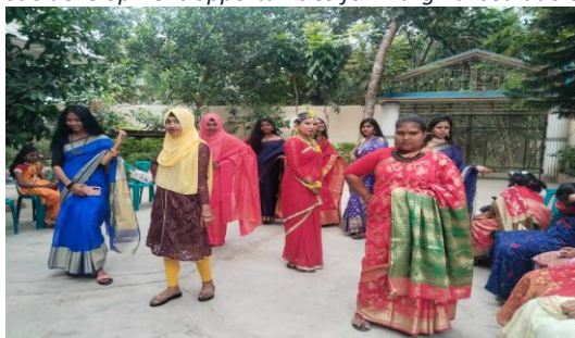
Young girls Empowerment & Fashion show competition

The Centre for Development & Peace (CDP) implements the Adolescents and Young Generation Program to create holistic development opportunities for marginalised adolescents and young girls in Meherpur, Bangladesh. The programme